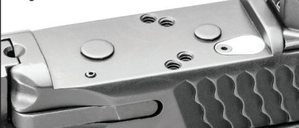
Slide Cut For Optics

Accepts Crimson Trace®, Trijicon®, Leupold®, Delta Point Pro, J-Point, Docter, C-MORE, Insight® and Nikon®