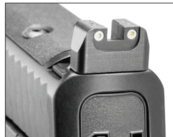
Optic Height Tritium Rear Sight