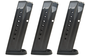
THREE MAGAZINES INCLUDED 17 Round - SKU: 194400000 UPC: 022188127942

Accepts Crimson Trace®, Trijicon®, Leupold®, Delta Point Pro, J-Point, Docter, C-MORE, Insight® and Nikon®